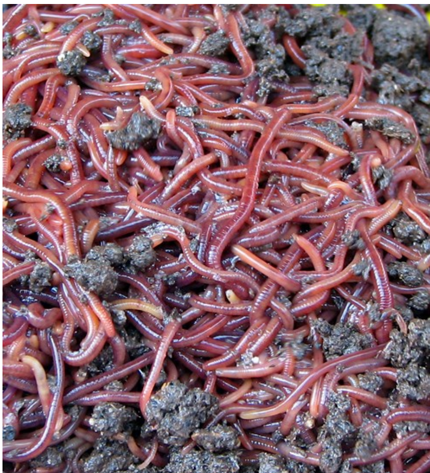
Photo 1. Eisenia fetida .

Ecotoxicological studies are normally carried out in artificial soil proposed by OECD (Organization of Economic Co-operation and Development) and ISO (International Organization for Standardization) guidelines. These guidelines were written focusing on the situation in countries of temperate regions. In these countries, the components of artificial soil particularly, the sphagnum peat moss is easily obtained. However, in order to allow its use in other regions of the world where the sphagnum peat moss is not readily available, some modifications are necessary.