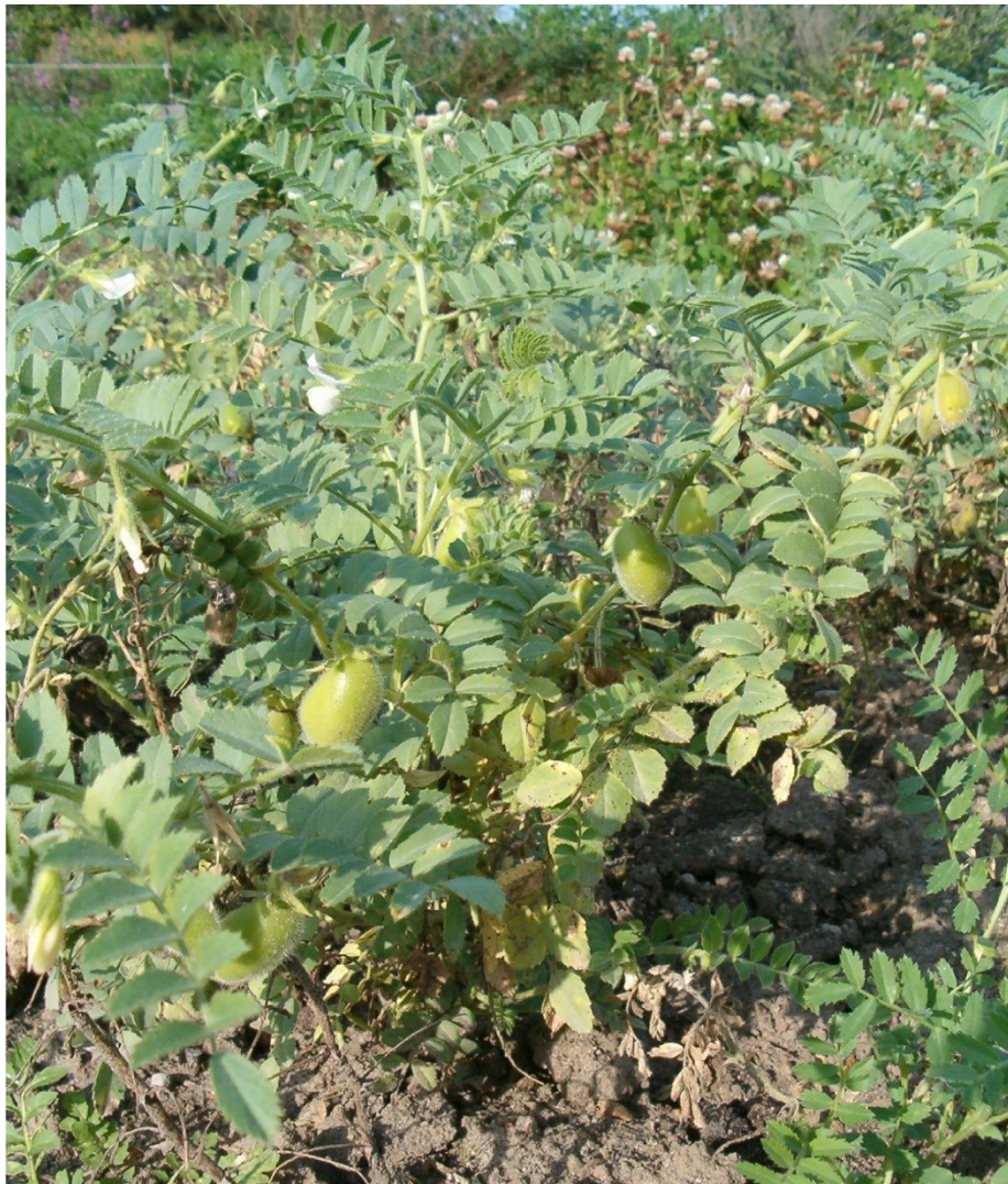
Photo 1. Cicer arietinum

crop improvement can be quickly achieved through induced mutagenesis. Since chick pea is a self pollinated crop, mutation breeding could be rewarding for broadening the genetic base of total plant yield, yield contributing traits.