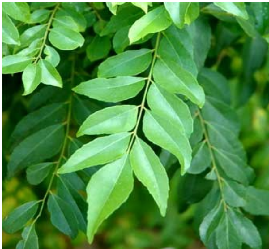
Fig. 1. Murraya koenigii (Linn.) Spreng. (Habit).

The macroscopical studies revealed the shape of leaves of Murraya koenigii (L) Spreng as obliquely ovate or some what rhomboid with acuminate obtuse or acute apex, bipinnately compound with exstipulate in alternate arrangement. The petiole were of 20 to 30 cm in length. The leaf had reticulate venation and dentate margin with asymmetrical base (Fig. 1 & 2).