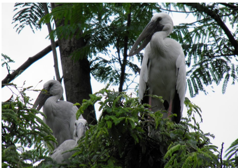
Fig. 2. Asian open bill stork, Anastomus oscitans inhabited in the study area (A group of three individual species).