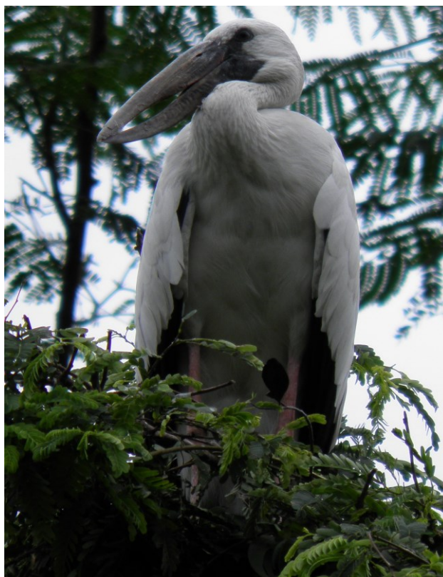
Fig. 3. Asian open bill stork, Anastomus oscitans inhabited in the study area (Closer view).