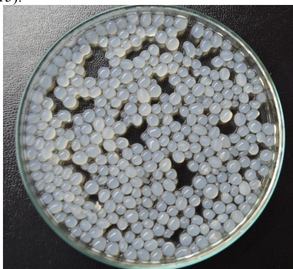
Plate.1. Sodium Alginate beads Containing Pseudomonas sp KLM9

Table 2 shows the effect of the different variables on the productivity of L-glutaminase by Pseudomonas Sp KLM9. Immobilized beads with 3.5% of sodium alginate and 18hr old biomass of Pseudomonas sp.KLM9 were found to be best for enzyme production. In the study conducted by Sankaralingam et al. , reports that, there will be variations in support matrix concentration with respect to matrix used for immobilizing Pseudomonas . Further the investigation revealed that, 5% sodium alginate is the best concentration to immobilize Pseudomonas for protease production (7). However, Pseudomonas sp.KLM9 entrapped in sodium alginate were significantly increased the enzyme yield with the activity from 125 IU to 162 IU. Figure 1 shows the L-Glutaminase productivity by free and immobilized cells of Pseudomonas sp KLM9. Lingappa et al. , reported the considerable reduction in fermentation time along with considerable increase in the L-Asperginase production with immobilized cells of Streptomyces gulbergensis (15).