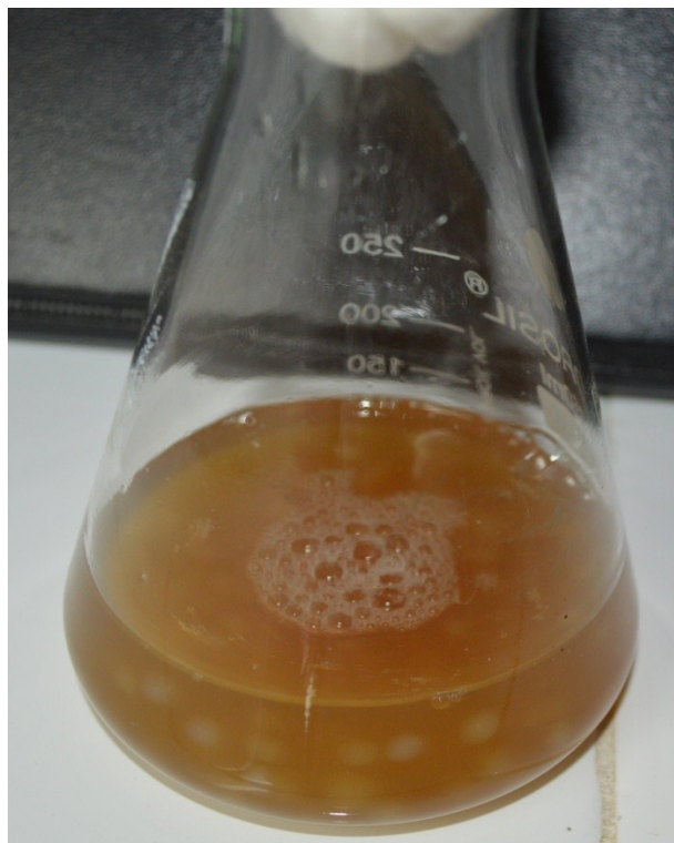
Plate. 2. L-Glutaminase Production by Immobilized Pseudomonas Sp KLM9 under Submerged Fermentation