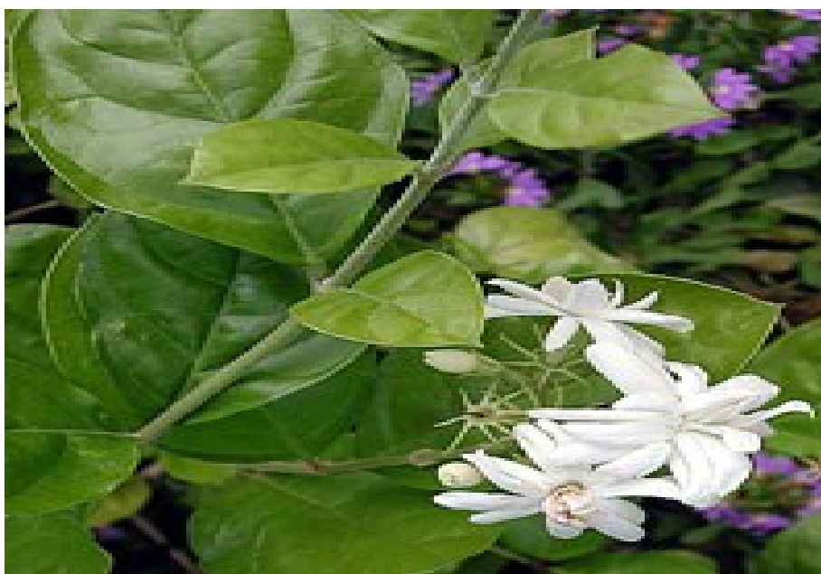
Fig. 1 Morphology of Jasminum sambac Linn. (Whole Plant) and Leaf

The methods carried out in the present research work namely .The pharmacognostical and physicochemical characteristics of Jasminum sambac Linn , which could be used in identification and to distinguish the plant material, were determined and established. The ethnobotanical study of plant material reveals about its potential to cure various ailments. The present study may be useful information with regards to its, ethno- pharmacological potential, screening and isolation of phyto-constituent to carrying out further research.