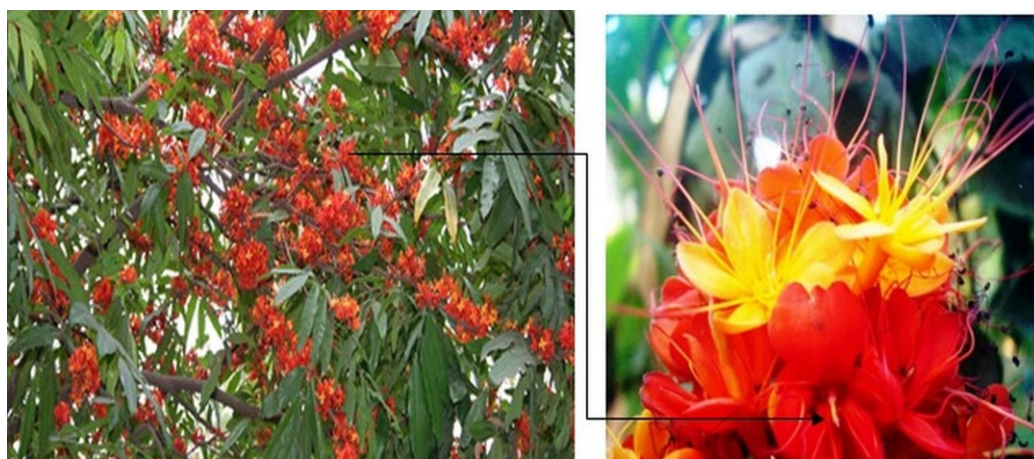
Fig. 1, Flowers of Saraca asoca

A tree about 6-9 m. high, branches glabrous. Leaves paripinnate, 15-20 cm long, leaflets 6-12, oblong or oblong lanceolate, corky at the base, petioles very short, stipules intrapetiolar, completely united. Flowers are usually to be seen throughout the year, but it is in January to March that the profusion of orange and scarlet clusters turns the tree into an object of startling beauty. Pinned closely on to every branch and twig, these clusters consist of numerous, small, long-tubed flowers which open out into four oval lobes. Yellow when young, they become orange then crimson with age and from the effect of the sun's rays eventually turning vermillion. From a ring at the top of each tube spread several long, half-white, half-crimson, stamens which give a hairy appearance to the flower clusters. Pods black, flat, leathery, 10-25 cm x 3.5-5 cm, seeds 4-8, ellipsoid-oblong, 28 cm. compressed.