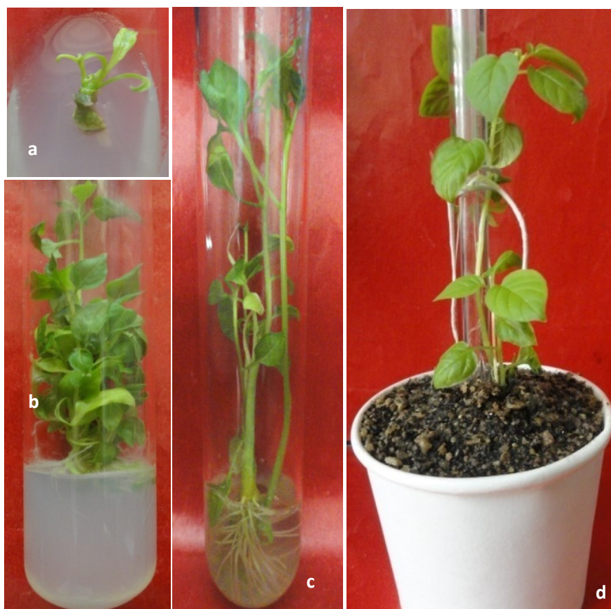
Plate II. In vitro shoot induction, proliferation and acclimatization from nodal explants of Physalis minima L. a) Initiation of direct multiple shoots from nodal explants on MS + 2.0mg/l 2,4-D + 1.0mg/l Kn. b) Multiple shoot formation from in vitro derived nodal explants on MS + 2.0mg/l 2,4-D + 1.0mg/l Kn after 15 days. c) Root induction on MS + 1.0mg/l IBA. d) Acclimatized potted plant.