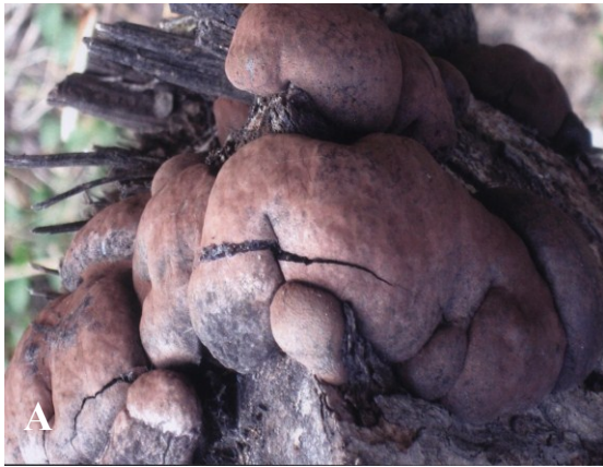
Figure A: Breakage of two side branches at forking in Tamarindus due to canker rot. B: Breakage at forking in Tamarindus indica tree due to canker rot by Daldinia concentrica C: Cubical white rot of stem with mycelium patch (arrow) D: Heart rot in trunk of Tamarindus tree