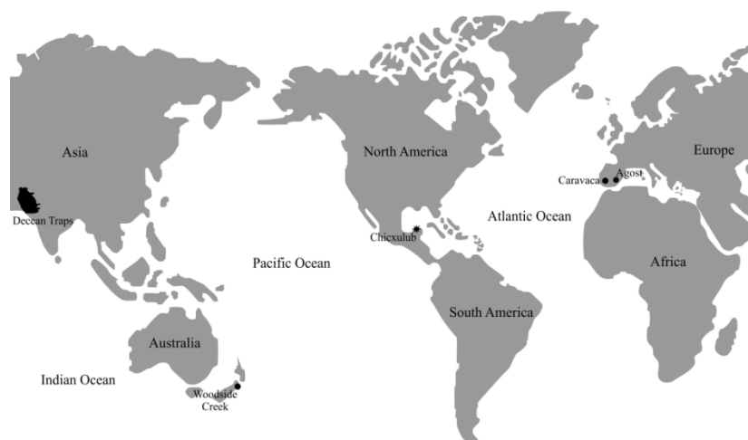
Figure 1. Geographic locations of the KPB clays at Caravaca, Agost and Woodside Creek enriched with Ir and As, including the Chicxulub impact site and Deccan Traps.

Ejecta layer. Alvarez et al. [1] explained the presence of anomalous iridium (Ir) in prominent marine Cretaceous-Paleogene (KPB) clays at three localities (Gubbio in Italy, Stevns Klint in Denmark, and Woodside Creek in N. Zealand) by proposing a late Cretaceous asteroid impact. Around the same time Smit and Hertogen [2] reported an anomalous Ir in the marine boundary clay at Caravaca (Spain). This suggestion was followed by reports of the Ir anomaly in many other marine/continental boundary clays worldwide [3]. These clays mark one of the most significant impact events in the Phanerozoic, one that appears responsible for one of the greatest extinctions in Earth's history.