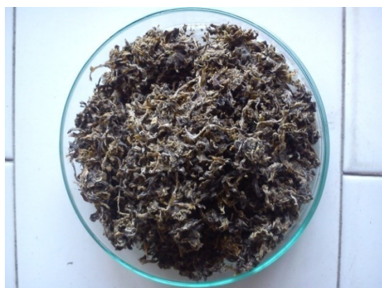
(g) Initial sugar beet pulp waste