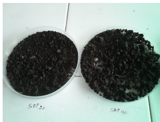
(h) Final vermicompost