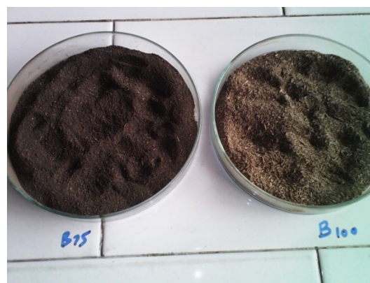
(d) Final vermicompost