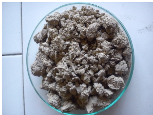
(e) Initial sugar beet mud waste