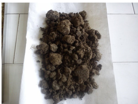
(a) Initial Pressmud waste

In sugar industry, sugar cane and sugar beets are used for sugar production. The solid wastes generated from sugar cane are pressmud, bagasse, bagasse fly ash whereas, sugar beet mud and sugar beet pulp are generated from sugar beets. Bagasse is used as a fuel to generate electricity. Bagasse fly ash, pressmud and sugar beet mud are disposed off in open fields which pollute the environment of that area. Sugar beet pulp is used as a ruminant feed. Vermicomposting technique as a nature-friendly process to degrade these wastes into nutrient rich manure has been used at vermicomposting unit of Guru Nanak Dev University campus Amritsar. The initial and final vermicomposted sugar industrial wastes (Pressmud, bagasse, sugar beet mud and sugar beet pulp) that were processed at our vermicomposting unit are shown in figure 1 (a-h).