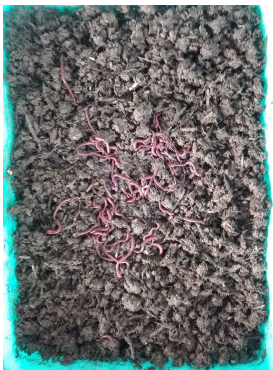
Figure 2. Ecological Engineer ( Eisenia fetida ) growing well in the pressmud and cattle dung mixture (50:50).

The different sugar mill wastes increased growth rate, worm biomass and reproduction of earthworms due to the uptake of nutrients available in these wastes. Loh et al., [36] studied that biomass gain and cocoon production was more in cattle dung than in goat manure and thus cattle dung provided a more nutritious and friendly environment to the E. fetida than goat manure. The feed substrates which provides earthworms with sufficient amount of easily organic matter and non-assimilated carbohydrates, favour the growth and reproduction of the earthworms [37]. Suthar, [38] reported that in addition to the biochemical properties of waste, the microbial biomass and decomposition activities during vermicomposting are also important in determining the worm biomass and cocoon production. Figure 2 shows the suitability of earthworm Eisenia fetida as ecological engineer while degrading pressmud sludge and cattle dung in the ratio of 50:50.