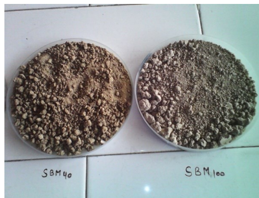
(f) Final vermicompost