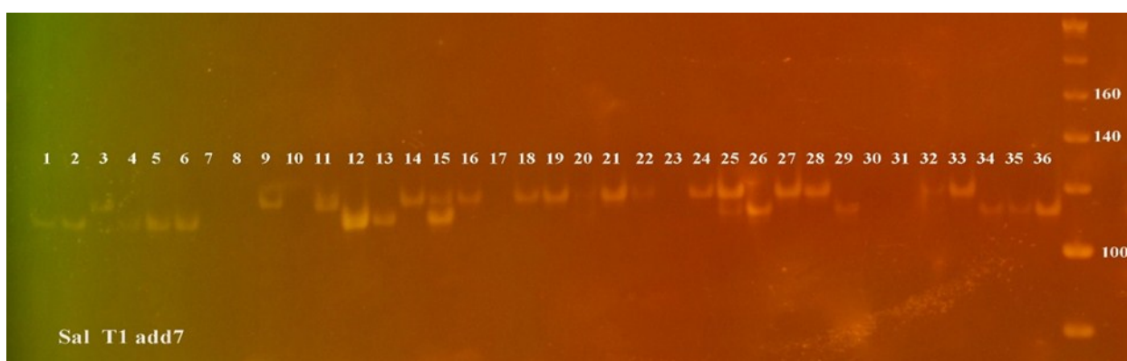
Fig. 2A. Representative images of 6% polyacrylamide gel profile of PCR product from 36 genotypes using SalT1_add7 primers.

Based on the difference in nucleotide sequence between candidate genes and SalT reference gene, two primers namely SalT1_add7 with the sequence: SalT1_add7F : AAAGTTGACGATTCCAAAAT/ SalT1_add7R : GTAAATACAAAAGCACATCTT and SalT1_add6 with the sequence: SalT1_add6F : TACGTGTTGCACCGATCCGT/ SalT1_add6R : TGCTGAACATGTACAAATGacc were designed by using Primer 3.0 software. It is able to amplify the candidate gene with the calculated size in the rice landraces carrying the candidate genes involved in salt tolerance, which demonstrated identical to the reference gene and different sequence to compare with the published sequence segments (Fig. 2A).