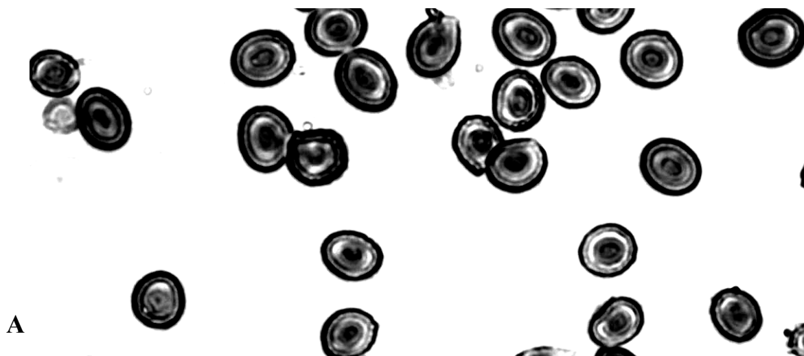
Figure 1. A. Normal and B. Micronucleated (indicated arrow) peripheral erythrocytes of catfish, H. fossilis (Bl.) after acute in-vivo exposure of zinc.

a Mean ± S.D; n = 10. *P < 0.001 (compared between control vs. all zinc concentrations) γ P < 0.001 (compared between 10 ppm vs. 30 ppm zinc concentration).