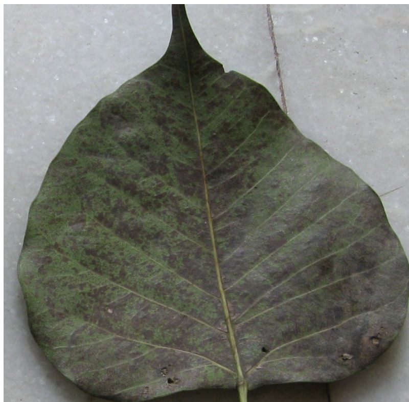
Fig. 5. Necrosis in leaf of Ficus religiosa .