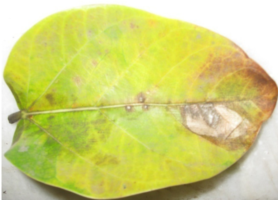
Fig. 6. Chlorosis and necrosis in leaf of Ficus bengalensis .