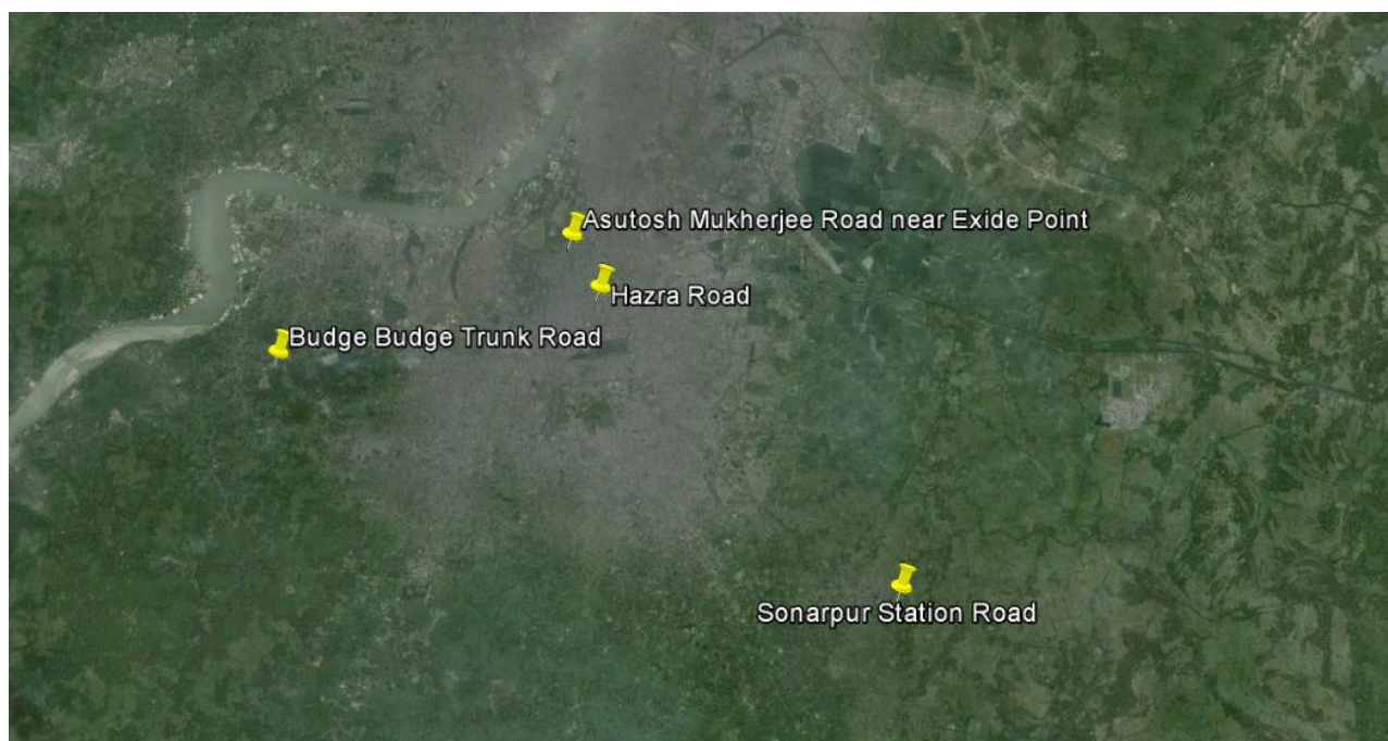
Fig. 1. Satellite image of sampling points within study area.