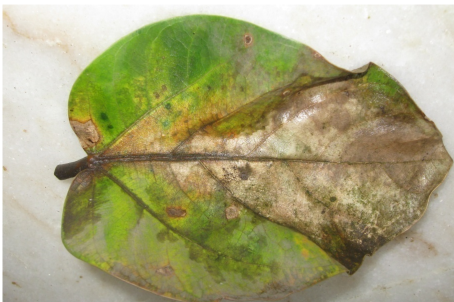
Fig. 7. Pigmentation, burning and necrosis in leaf of Ficus bengalensis .

In all experimental sites such as MVL, HVL and HeVL, the extra growth and reduction pattern significantly ( P < 0.001 , 0.01 or 0.05 ) observed when compared to control site (LVL) for L, B and L/B ratio. The visible injuries of leaves were also observed in increasing trends.