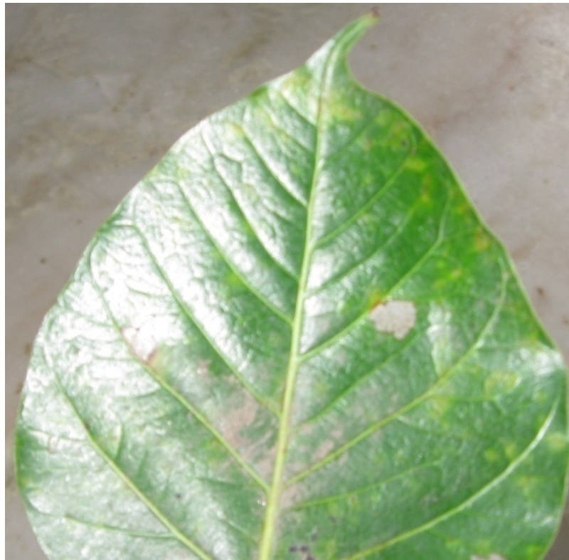
Fig. 4. Pigmentation and necrosis in leaf of Ficus religiosa .